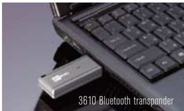
3610 Bluetooth transponder

Smaller than your mobile phone, the 1660 series pocket-size scanners pack a lot of versatility in a handy package. The 1660 series delivers a great amount of scans over a day of work on a pair of replaceable AAA batteries or the option of rechargeable Li-ion batteries. Besides, when used as memory scanners, the 1660 series hold over 10 thousand scans.